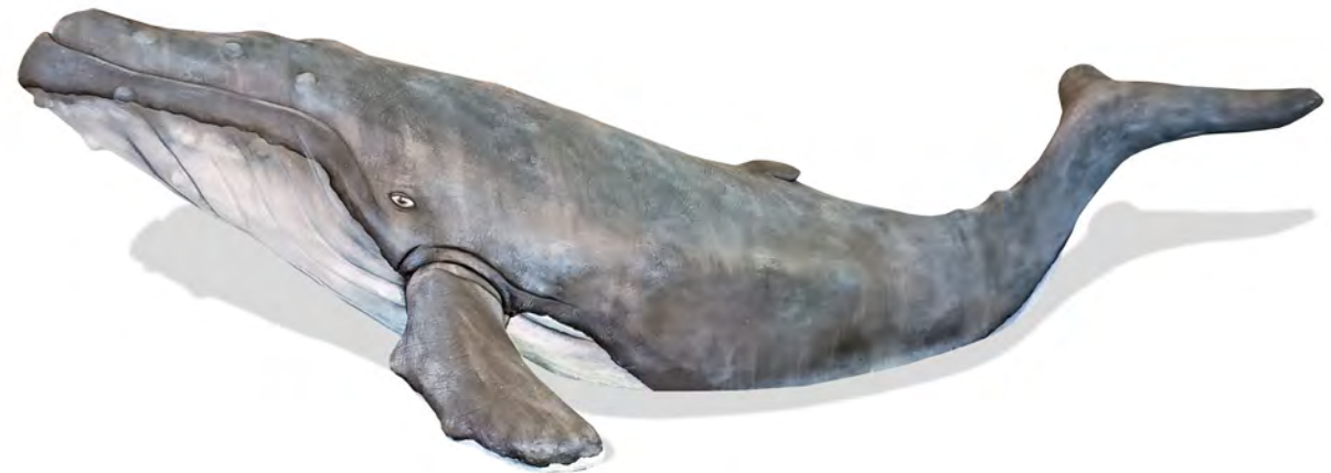
3 Humpback Whale_TC023